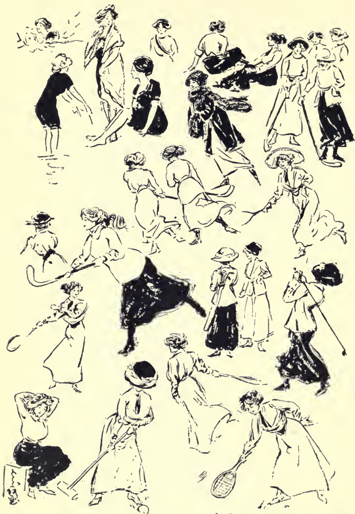
John Bull's playing